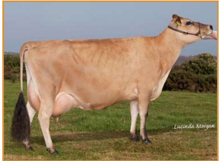
Above: Quintrell Hot Pink EX91 the eldest daughter of Ultra Marine, pictured in her 7th lactation in 2012, she is the dam of Quintrell Ringmaster Magenta EX93-5E.