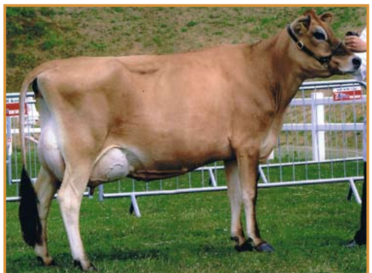
Top: Quintrell PJSJM Ultra Marine EX95-7E, pictured in 2012 in her 9th lactation having produced over 70 tonnes milk and below her earlier in life, pictured in her 2nd lactation at the Royal Cornwall where she was twice interbreed champion.