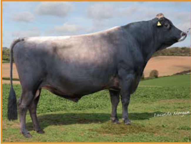
Quintrell Maximus Cobalt EX93-2E, Ultra Marine's most successful son with 11 EX and 18 VG daughters to date.

frame and capacity while foot angle and locomotion are areas worthy of protection when correctively mating with him. Interestingly his greatest impact has no doubt been within the herd where he was born, as there are so far nine EX daughters of Cobalt carrying the Quintrell prefix, the highest scored being the EX94 Quintrell Cobalt Osprey. The next chapter of the Colour family story may well from the male perspective come down to the March 2017 born bull Quintrell Ladd Taupe. He is by the American sire Goldust Karbala Ladd, and Taupe is certainly very promising from a genomic perspective, he is from the 6736kg 6.19% fat and 4.15% protein Quintrell May Carmine EX92-2E, and subject to passing the relevant health tests will enter the Cogent stud soon.